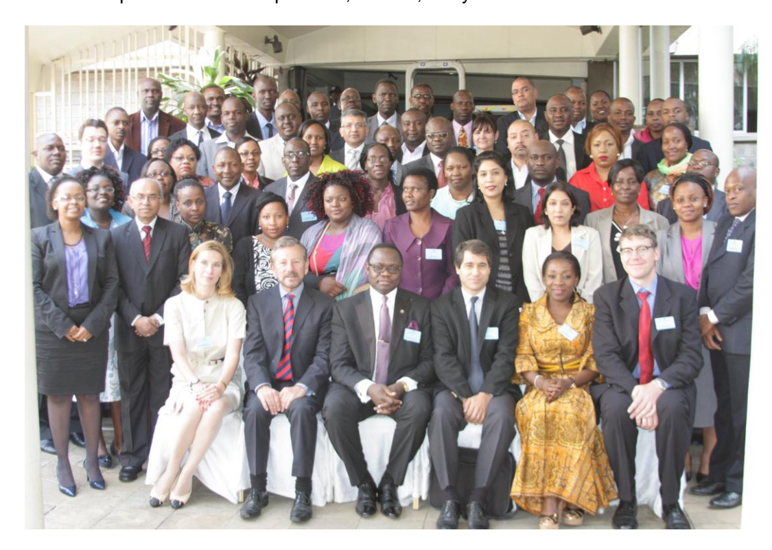
IOPS/MFW4A/RBA Workshop: Strengthening private pension systems in Africa through effective supervision, 4-5 September, Nairobi, Kenya