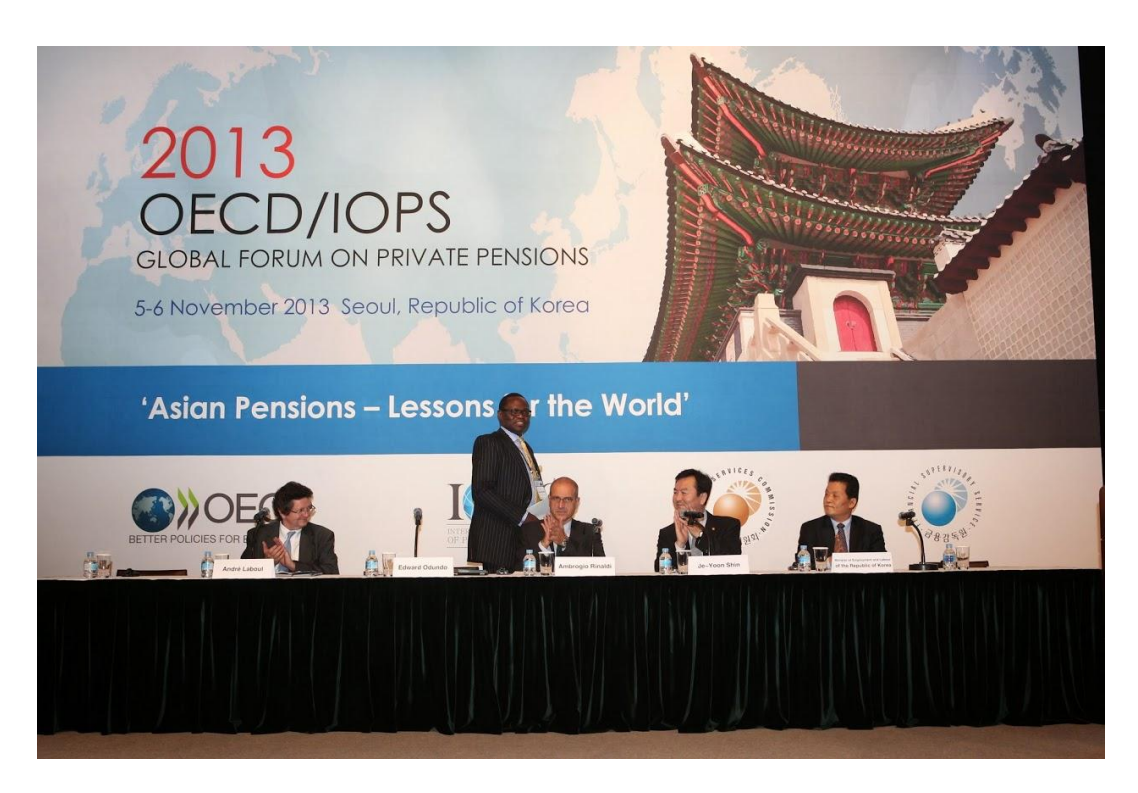
OECD/IOPS Global Forum on Private Pensions 5-6 November 2013, Seoul, Republic of Korea