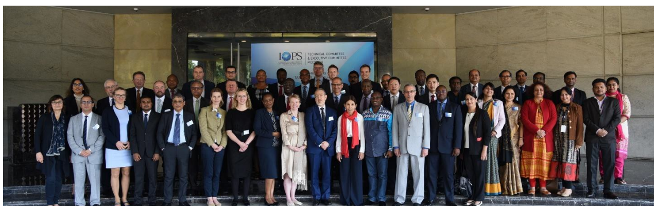
IOPS Technical Committee Meeting 6th March 2019 New Delhi, India