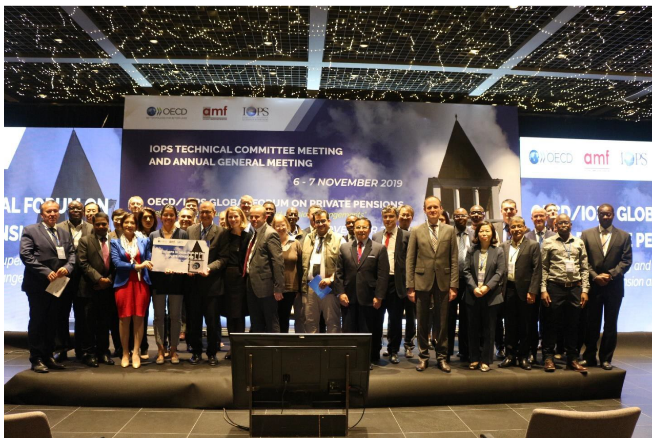
OECD/IOPS Global Forum on Private Pensions: Developing and supervising occupational pension arrangements, 7-8 November 2019, Tirana, Albania

The Secretariat engaged in the establishment, operation, preparation, and organisation of meetings for the Executive and Technical Committees held in 2019 in New Delhi (March), Paris (June) and Tirana, Albania (November). Secretariat analytical and organisational support was also provided for the Annual General Meeting of the Governing Membership held in Tirana, Albania in November 2019.