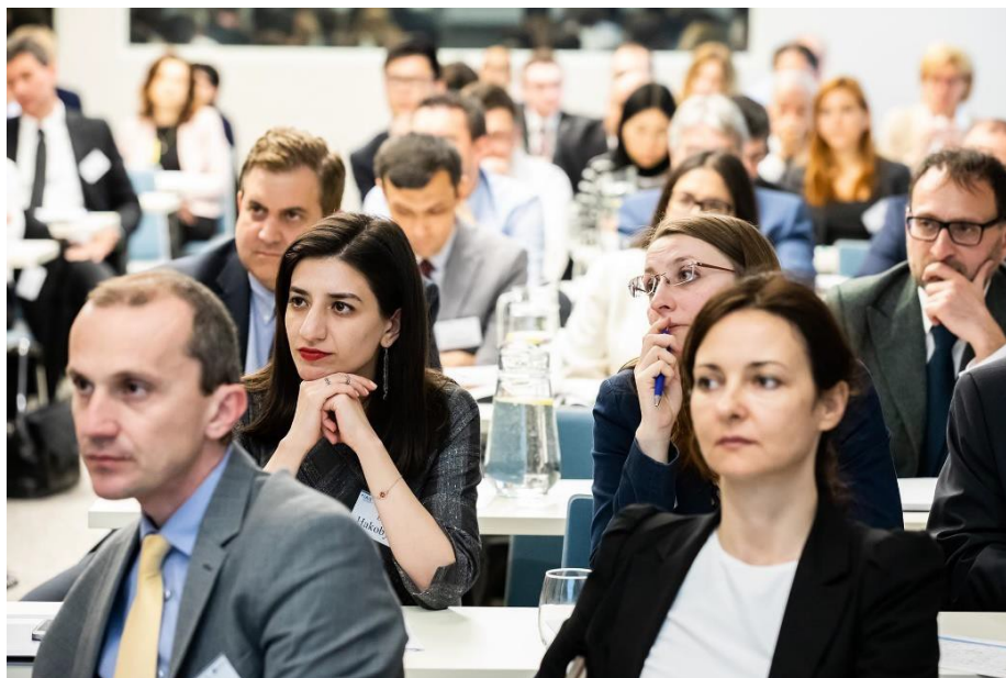
Joint IAIS-IOPS-OECD-NBS Conference on synergies between Insurance and Pensions, Bratislava, Slovak Republic, 10-12 April 2019