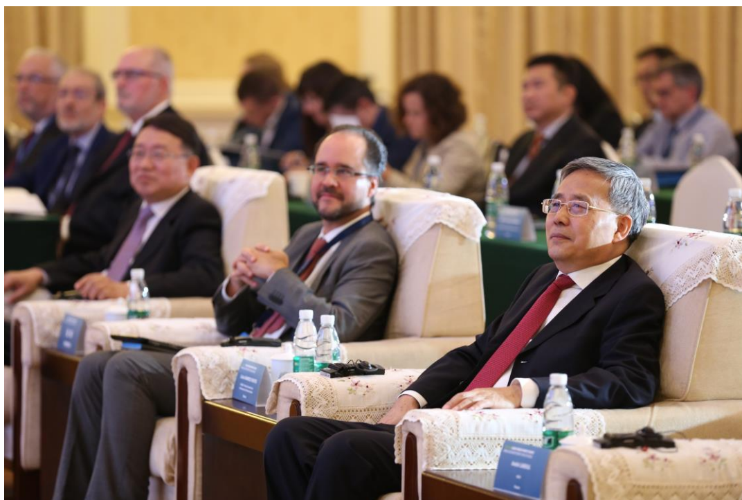
OECD/IOPS Global Forum on Private Pensions: Designing pension systems to cope with the ageing challenge, 25-26 October 2018, Beijing, China