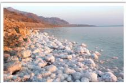
The Dead Sea coastline with its spectacular salt crystal formations.

At 410 meters below sea level, the Dead Sea is the lowest place on earth. Jordan's Dead Sea coast is one of the most spectacular natural and spiritual landscapes in the world and it remains as enticing to international visitors today as it was to kings, emperors, traders, and prophets in antiquity.