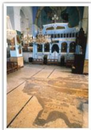
The Mosaic at St. Georges Church in Madaba.

The trip south from Amman along the 5,000-year-old Kings Highway is one of the most memorable journeys in the Holy Land, passing through a string of ancient sites. The first city to encounter is Madaba, "the City of Mosaics". The city, best known for its spectacular Byzantine and Umayyad mosaics, is home to the famous 6th century mosaic map of Jerusalem and the Holy Land.