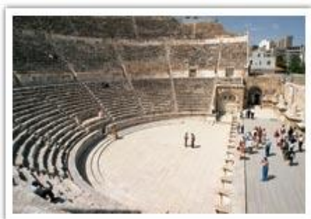
The Roman Theatre in Amman.

A sprawling city spread over 19 hills, or "jebels". Amman is the modern, as well as the ancient capital of the Hashemite Kingdom of Jordan. Known as Rabbath-Ammon during the Iron Age and later as Philadelphia, the ancient city that was once part of the Decapolis league, now boasts a population of around 1.5 million. Often referred to as the white city due to its low size canvas of stone houses, Amman offers a variety of historical sites such as the Citadel and the Roman Theatre.