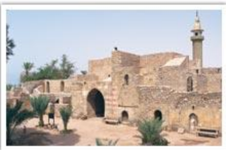
The Fort at Aqaba.

Famed for its preserved coral reefs and unique sea life, this Red Sea port city was in ancient times, the main port for shipments from the Red Sea to the Far East.