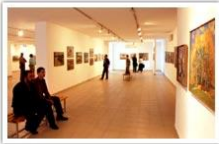
Art Gallery in Amman.

Jordan has a rapidly developing fine arts scene, including an increasing number of female artists. Today, artists from various Arab countries find freedom and inspiration in Jordan. The Jordan National Gallery of Fine Arts (Tel: 4630128, Fax: 4651119), for example, boasts a fine collection of paintings, sculptures and ceramics by contemporary Jordanian and Arab artists.