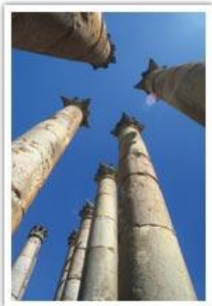
The Temple of Artemis at Jerash.

A close second to Petra on the list of favourite destinations in Jordan, the ancient city of Jerash boasts an unbroken chain of human occupation dating back more than 6,500 years. The city's golden age came under Roman rule and the site is now generally acknowledged to be one of the best preserved Roman provincial towns in the world.