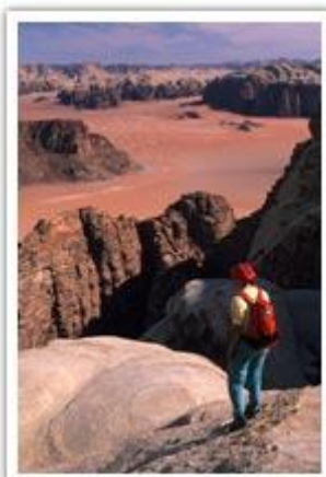
On top of one of Wadi Rum's towering mountains.

Wadi Rum is a protected area covering 720 square kilometers of dramatic desert wilderness in the south of Jordan. Huge mountains of sandstone and granite emerge, sheer-sided, from wide sandy valleys to reach heights of 1700 meters and more. Narrow canyons and fissures cut deep into the mountains and many conceal ancient rock drawings etched by the peoples of the desert over millennia. Bedouin tribes still live among the mountains of Rum and their large goat-hair tents are a special feature of the landscape.